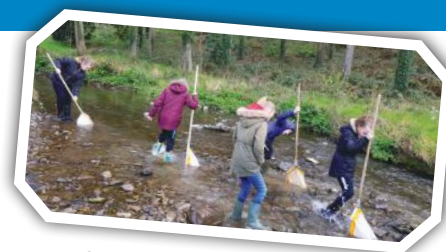
Figure 4 Year 5 pupils exploring a river habitat

As the same pupils moved into year 5 (age 9–10), they took part in 'Project Freshwater' (Figure 3). Classes were introduced to the topic through the bespoke workbook and then visited a freshwater river where they explored the biotic index, identified the fauna of the river, measured river speed using