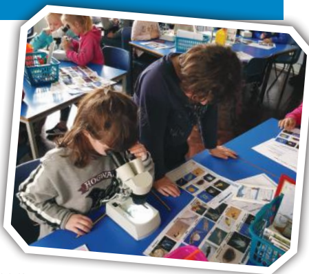
Figure 6 Year 6 using microscopes to observe and identify marine life

even ' a bit scared ' when it came to river sampling and investigating rocky-shore habitats. However, they spoke of feeling ' more confident ', it being ' easier than I thought ', feeling that ' I could do it ', and ' now I can do science '.