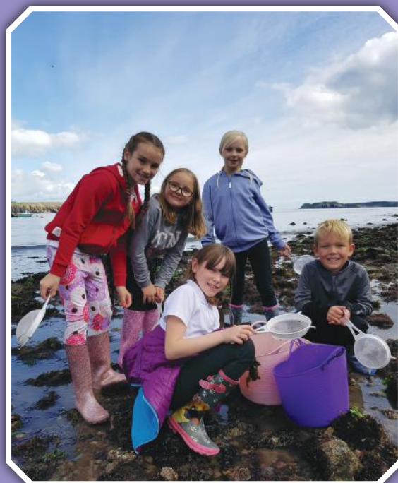
Figure 1 Exploring what lives on the rocky shore in year 6