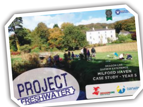
Figure 3 The 'Project Freshwater' workbook

Local partnership has been integral to the success of the programme. As a charity, the Darwin Experience is funded in part by the local authority and in part by a locally situated, global, private company reliant on science professionals. Dragon LNG is a re-gasifying terminal integral to the energy production of the UK, and major employer in the area. With Dragon LNG's financial support, the Darwin Experience has worked with a cluster of six primary schools. It paid for the development of teacher workbooks, transport to field trips and the time of Darwin Experience Officers across the three years. While a critical sponsor, Dragon LNG did not censor the content of the programme and the Darwin Experience was free to educate on all matters, including the negative impacts of fossil fuels and the need for alternatives. Apart from schools releasing teachers to join meetings in order to collaborate on the development of the resources (usually after school), this programme was free to schools. In recognition of their work, Dragon LNG was named winner of Business in the Community, Cymru's category of Responsible Business Award for Education, in 2016, and UK winner in 2017.